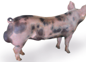
G Performer 6.0 Terminal Boar