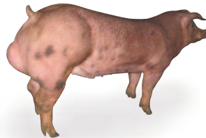
G Performer 4.0 Terminal Boar