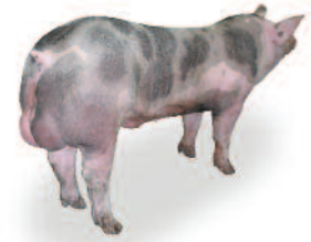
G Performer 8.0 Terminal Boar