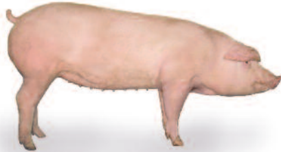
Fertilis 25 Commercial Female