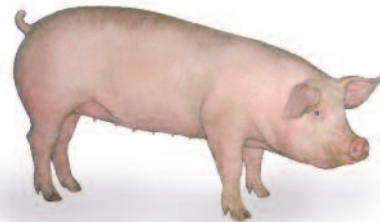
Fertilis 40 Commercial Female